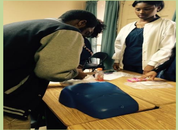
RCC students learning how to perform CPR